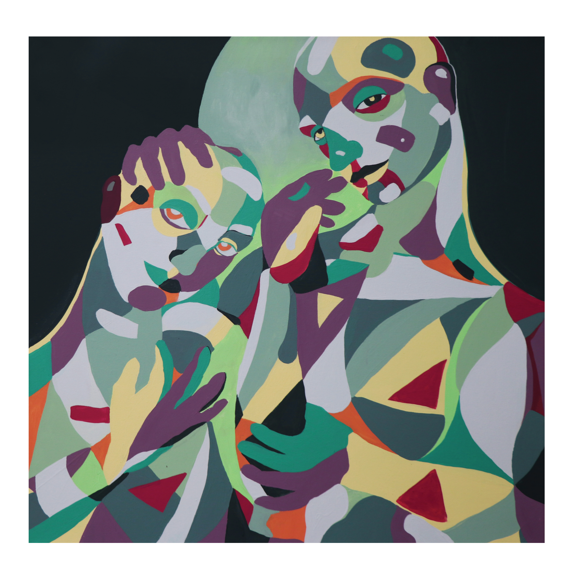
Kind of like this shadow side House paint on canvas | April 29, 2021 H30"W30" | H76.2cm W76.2cm $2,800