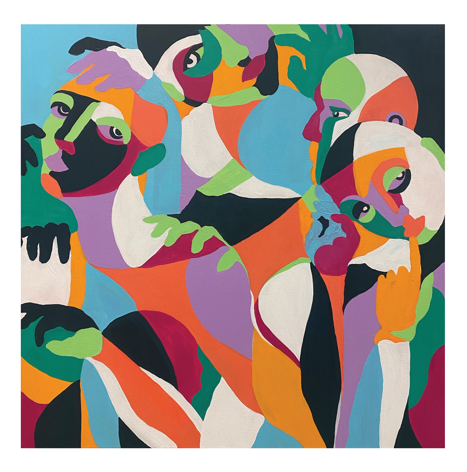
Puzzled crew House paint on canvas | April 28, 2021 H36"W36" | H91.5cm W91.5cm $2,700