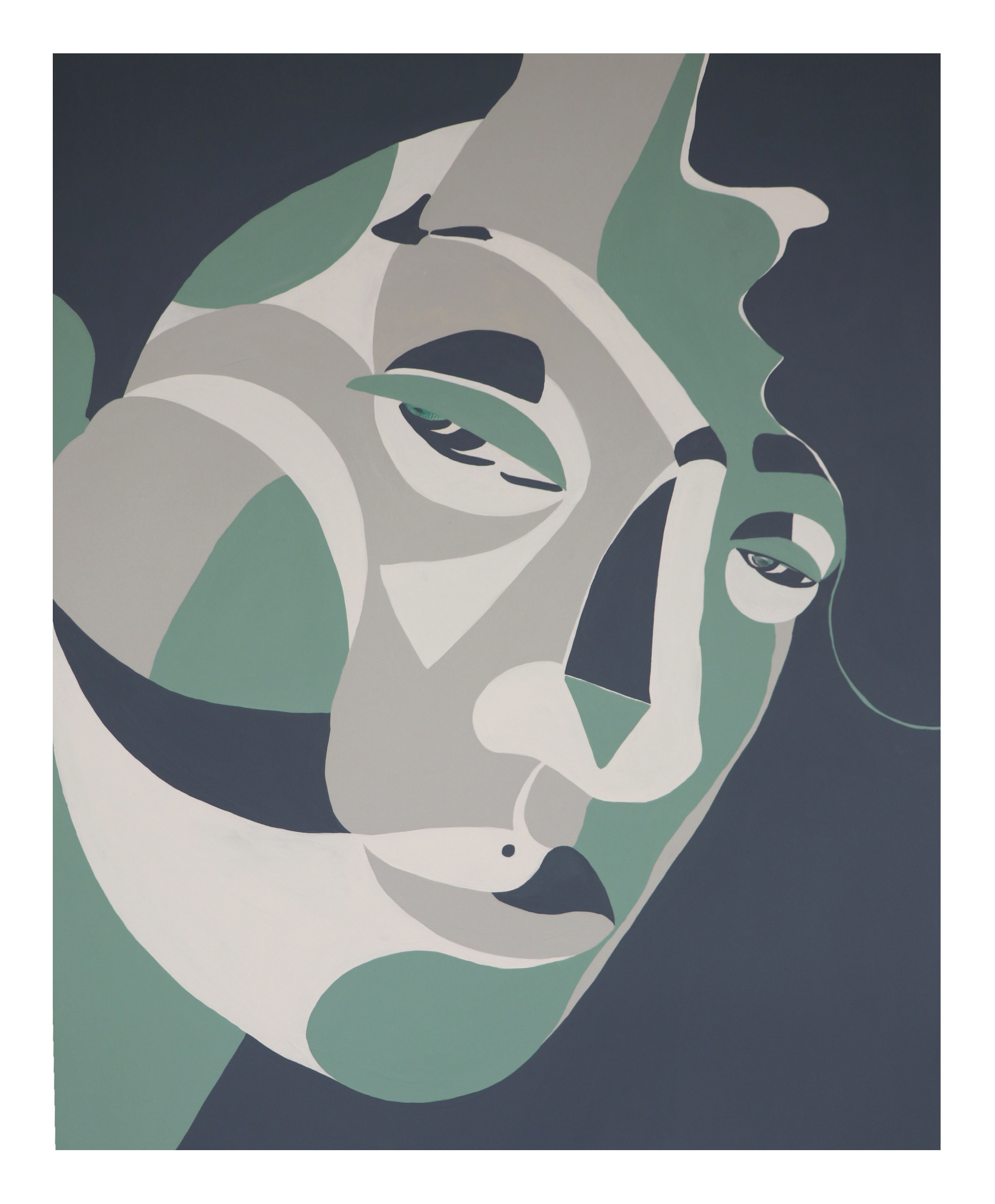
Ohhh well, so what House paint on canvas | April 26, 2021 H60"W48" | H152.4cm W121.9cm $3,500