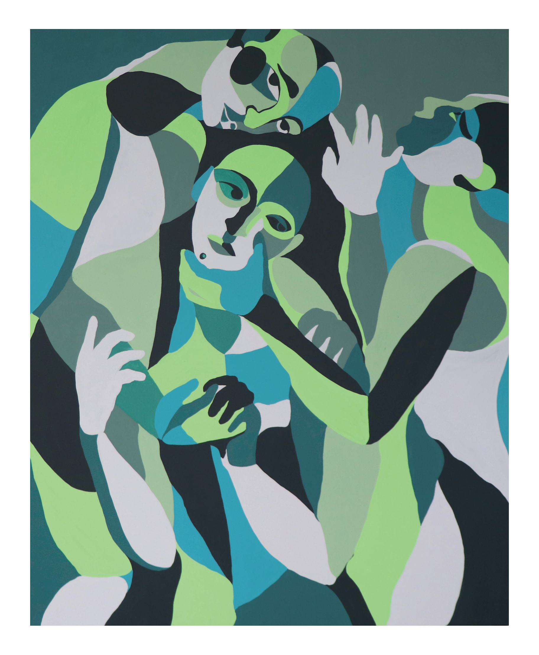
Quite the inner battle you've caused House paint on canvas | April 20, 2021 H60"W48 | H152.4cm W121.9cm $3,500