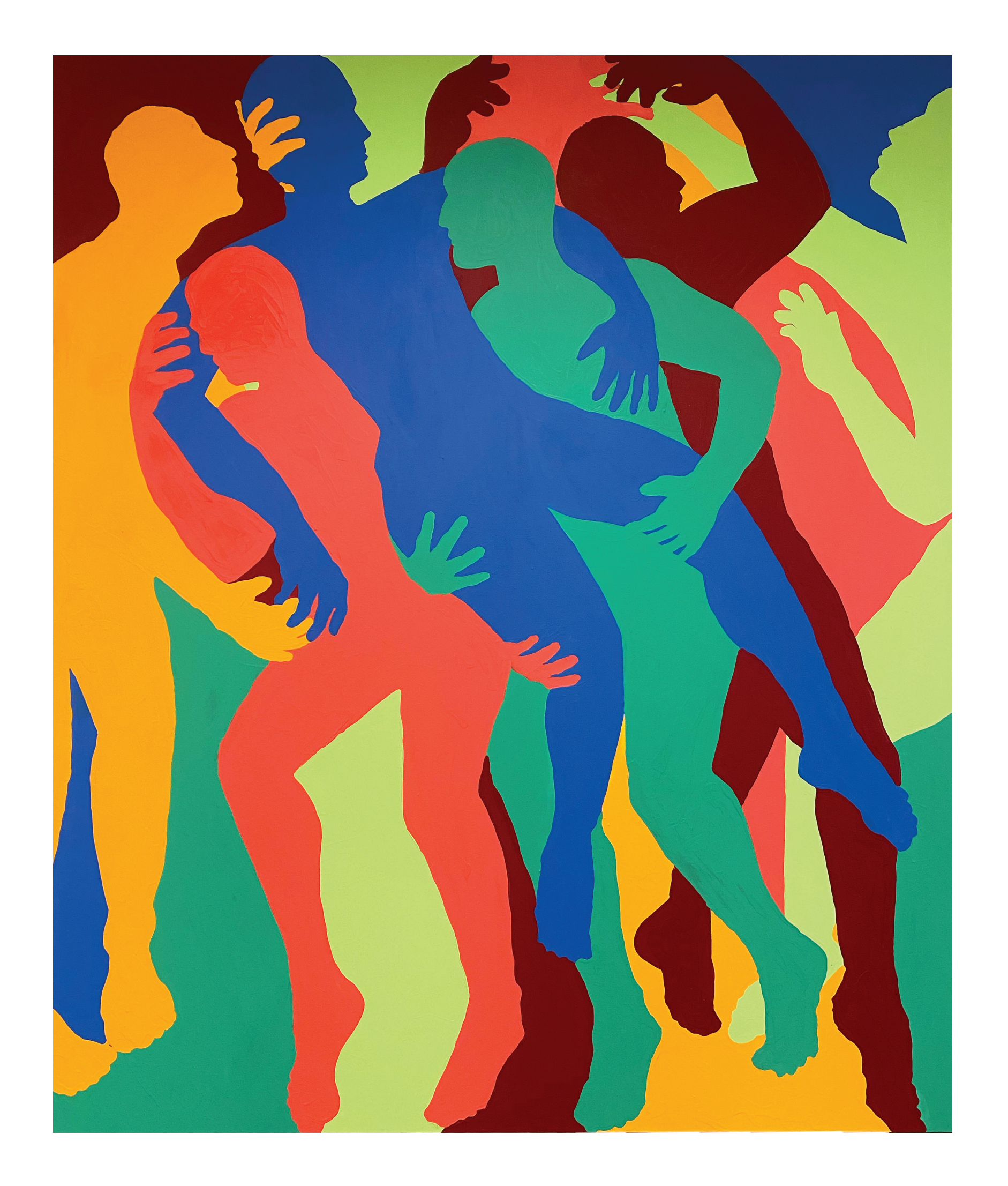
Escort me to the exit party House paint on canvas | April 16, 2021 H80"W72" | H203cm W182.8cm $4,300