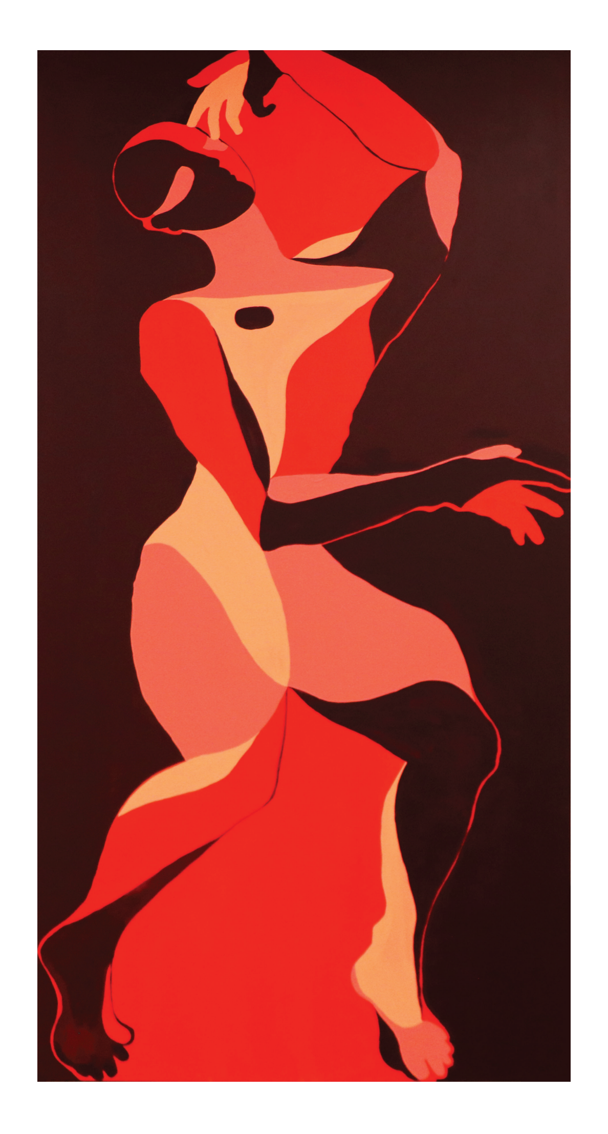
Enigmatic Disaster House paint on canvas | April 17, 2021 H72"W36" | H183 cm W91.5cm $3,200